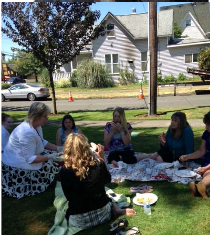
Washington County Circuit Court Staff Appreciation Picnic ...a good time was had by all!